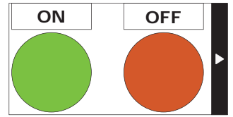
Label example after cutting